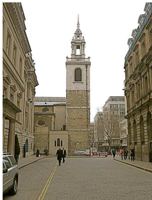
Tower in ragstone with Portland stone steeple 1717